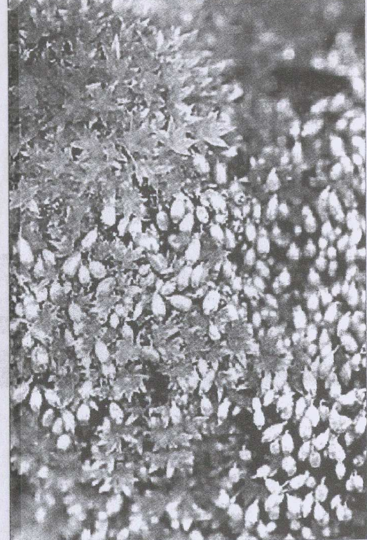
Photograph and illustration show Porsild's Bryum, a tiny moss with only six known locations in the province.

many unique plant and animal species," said Mr. Osborne. "Government will take the necessary action to ensure the protection of these species,